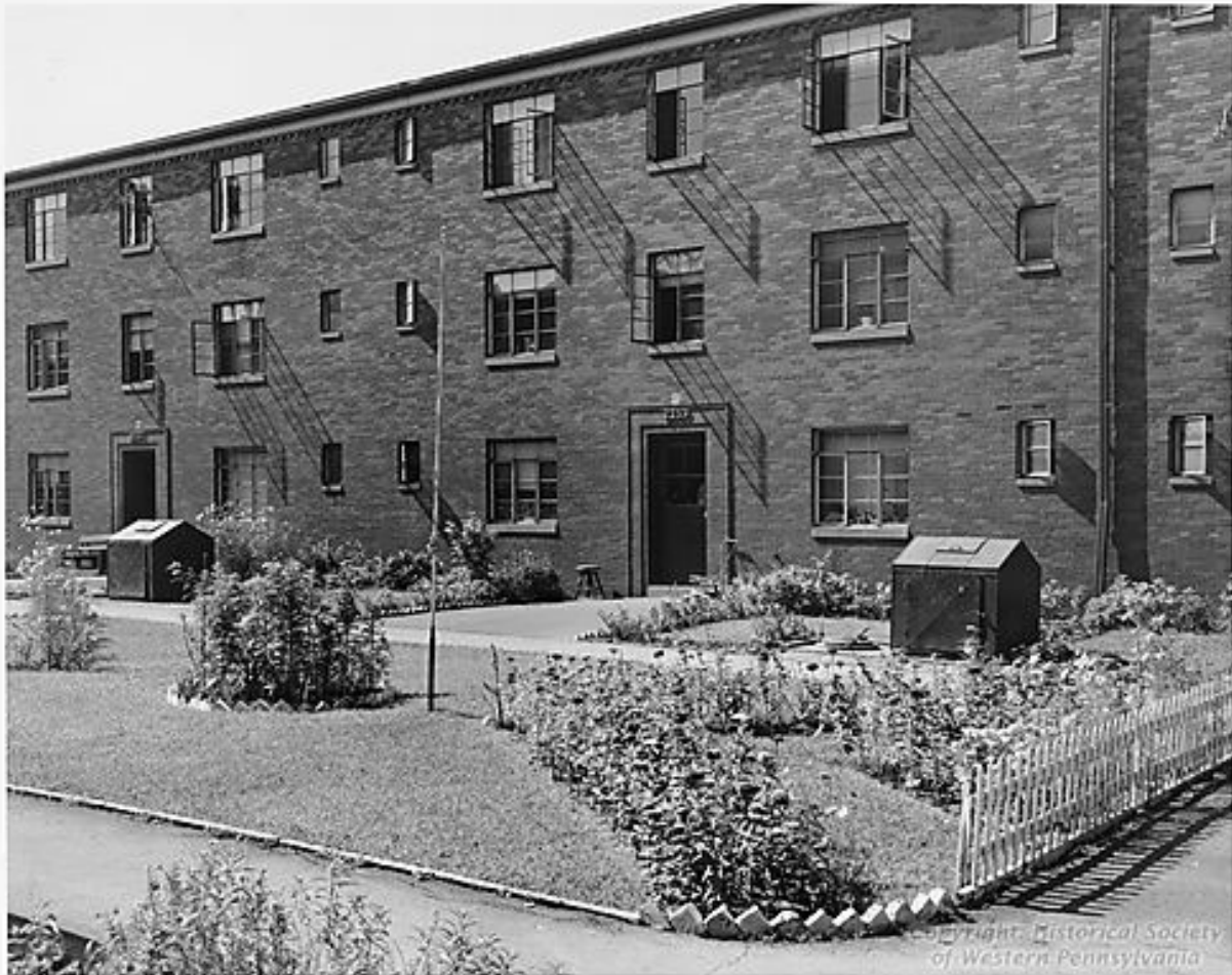
Bedford Dwellings (ca. 1951-1959), Pittsburgh, PA

investment firms which are scooping up low income and affordable homes around the world, ... substantially raising rents, forcing tenants out of their own homes.” 13 Likewise, on the local level, researchers note the tendency for powerful actors and institutions to favor growth-oriented policies that maximize returns on investment, with no concern for the human and social impacts. 14 Pittsburgh’s decades-long trajectory of declining population has reduced the city’s overall tax base, and private interests promising to kick-start growth have thus been able to wield undue influence on policy priorities.