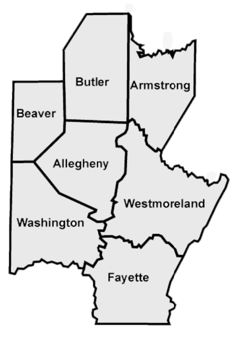
Figure 1. Counties of the Pittsburgh Metropolitan Statistical Area

Presented in this report is employment data by race, occupation and gender compiled by the place of work for individual workers at the time of the 2000 Census. This differs from employment data compiled by place of residence due to commuting patterns. The full EEO Special Tabulation includes separate compilations of employment data compiled by place of residence for most regions of the country. Employment compiled by place of residence for workers in the Pittsburgh Metro SA is one of seven regional datasets excluded from the EEO Special Tabulation because of confidentiality restrictions.