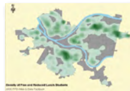
Sample analytic map showing where impoverished students reside.

Visual Analytics (VA) is the use of graphical, image, and other pictographic techniques to display and navigate large sets of data for the purpose of discovering relationships among the data. Analysts are quickly overwhelmed by large listings or tables of data. Through visualization techniques, millions of data points can be summarized in displays such as dashboards, maps, and diagrams. Color, size, position, orientation, and other features are used to represent characteristics of the data. Specialized tools have been developed to highlight relationships and changes in relationships. Anomalies are easily detectable. Real time and varying data can be shown by animation.